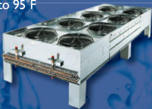
Typical remote condenser for air-cooled models. Remote Condenser configuration is determined by the Titan Chiller model.