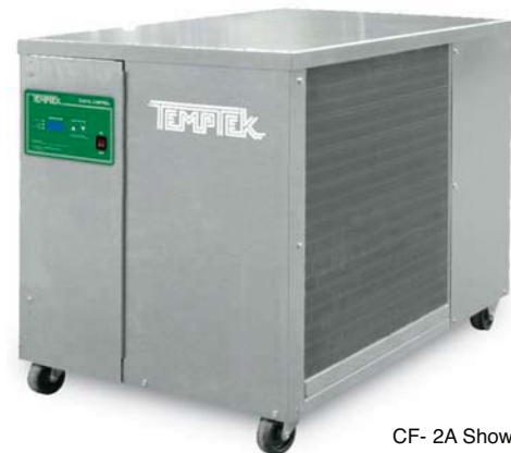
CF- 2A Shown