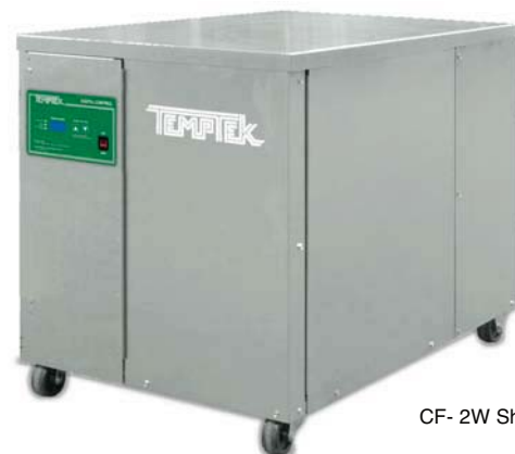
CF- 2W Shown