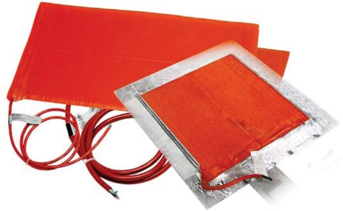
Fiberglass reinforced silicone rubber