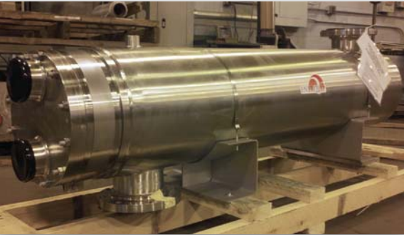
Insulated and Jacketed Exchanger