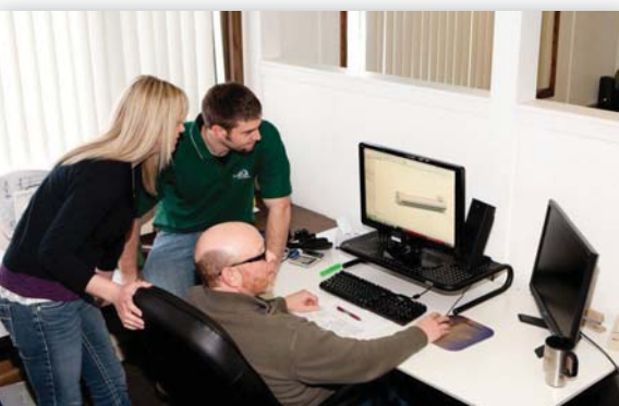
2D and 3D CAD Design