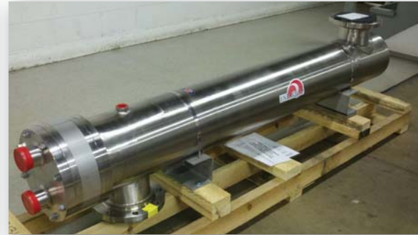
Hastelloy C-22 Exchanger