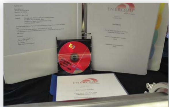
Detailed Documentation Package