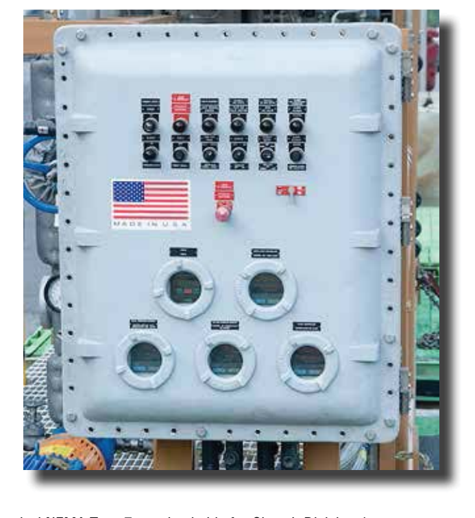
A typical NEMA Type 4 panel for areas temporarily exposed to combustible gases. Panel is equipped for Type Z pressurization and also purges the small panel on the left.