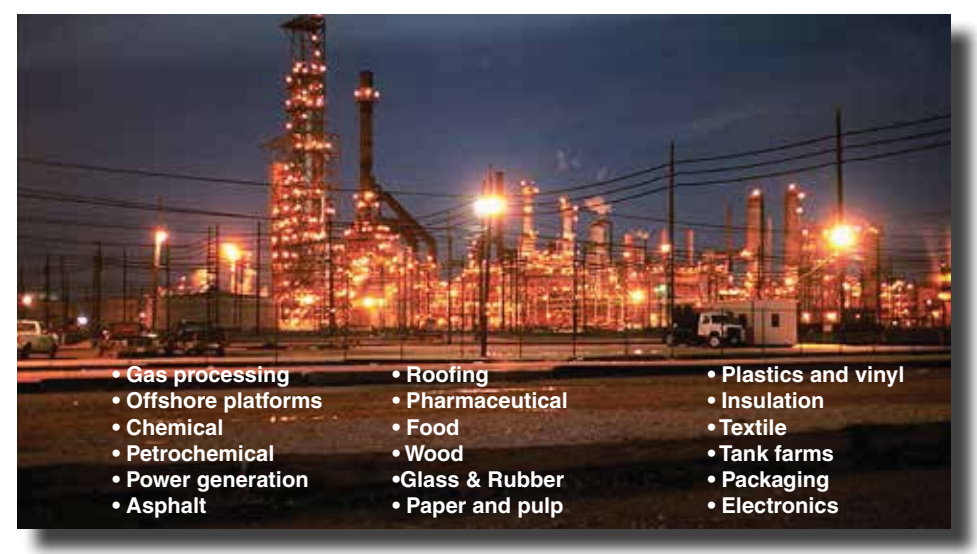
Heatec's electric circulation heaters can be used in a wide variety of industries.

HEATEC EHI HEATERS are commonly known as electric circulation heaters. They are used mainly by companies engaged in manufacturing and processing.