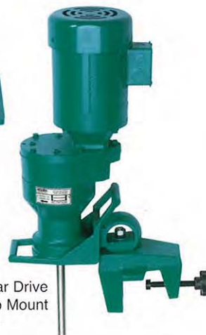
BGM Gear Drive Clamp Mount