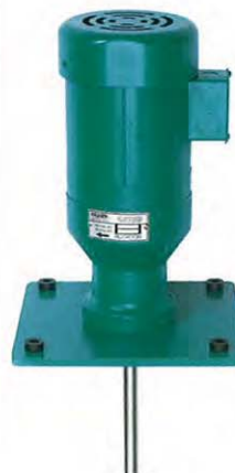
BDF Plate mount