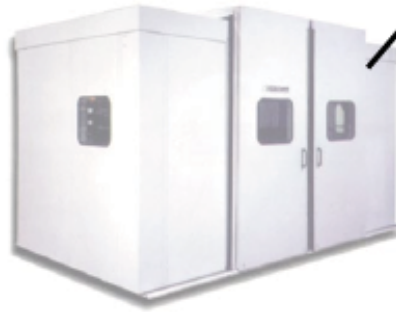
Quick Removable Panels