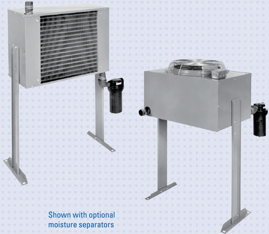
Shown with optional moisture separators