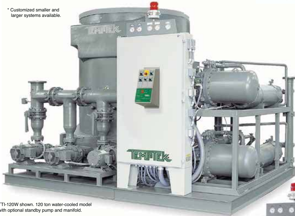
TTI-120W shown. 120 ton water-cooled model with optional standby pump and manifold.

* Customized smaller and larger systems available.