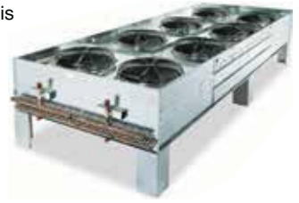
Remote Air-cooled condenser

TTI Series central chillers are offered with Air-Cooled or Water-Cooled condensers. The selection is influenced by the industrial environment where the TTI Series will be installed including available condensing water supply and plant ambient temperatures. The condenser is a heat exchanger where the heat absorbed by the refrigerant during the evaporating process is given off to the condensing medium. As heat is given off by the high temperature, high pressure refrigerant vapor, its temperature falls and the vapor condenses to a liquid.