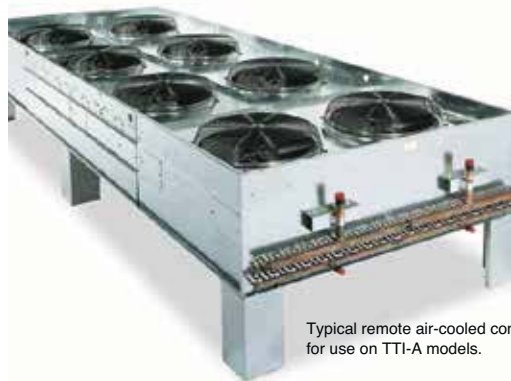
Typical remote air-cooled condenser for use on TTI-A models.