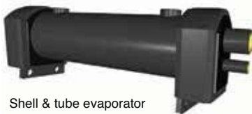
Shell & tube evaporator

Shell & tube evaporators are used on larger capacity systems. Refrigerant is circulated through copper tubes within the carbon steel shell to cool the process fluid that surrounds the tubes. Shell & tube evaporators are fully insulated and provide flexible, efficient heat transfer.