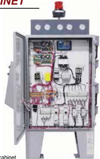
Typical electrical cabinet

* Water condensed only. Air condensed remote condensers require separate power.