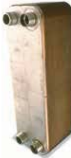
Brazed plate evaporator

Brazed plate evaporators are made of stainless steel plates brazed together with copper brazing material. This design promotes turbulent flow and high heat transfer rates in a compact, non-ferrous package. A cleanable basket strainer filter is included to protect the brazed plate evaporator from water born contamination.