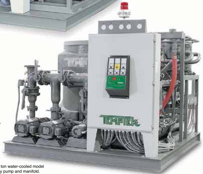
TTI-60W shown. 60 ton water-cooled model with optional standby pump and manifold.