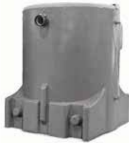
Polyethylene reservoir with insulation

The standard patented reservoir is a one-piece seamless design, rotationally molded from linear low density polyethylene and insulated with 3/8" dense foam insulation. The rectangular base accepts straight-line pump connections. The cylindrical shape adds structural strength. A tank baffle provides true 'hot-cold' operation. The standard service cover has cut-outs for distribution piping and an inspection opening. The tank volume is adequate to support expansion to 2 times its original chiller capacity (adding MA or MW chilling modules and additional pumps).