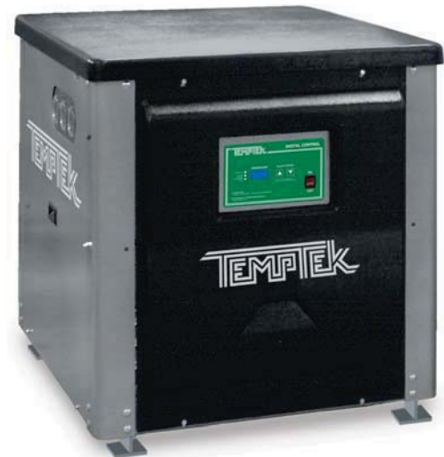
CF-10A-RC indoor unit