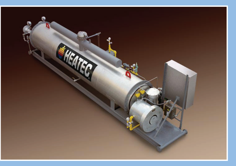
Heatec 670,000 Btu/hour water-bath heater for heating natural gas. It has a natural draft burner.

The expansion chamber stores water overflow created by expansion. It also serves as water saver by reducing evaporation.