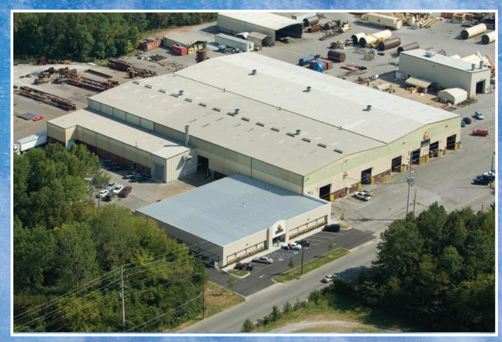
Heatec facility in Chattanooga, Tennessee

Heights shown include expansion tank, but do not include the stac