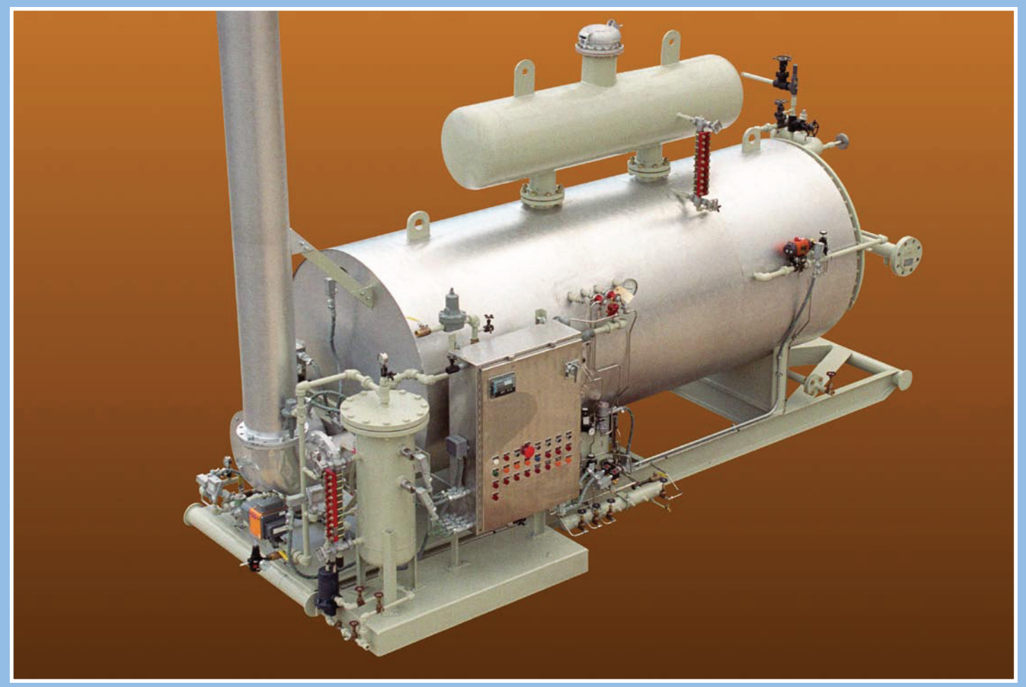
Heatec 400,000 Btu/hour water-bath heater for heating natural gas. Has a natural draft burner.

AQUATEC<sup>™</sup> is the name for a new series of water-bath heaters from Heatec. The name distinguishes this line of heaters from the many other types of heaters we make. Aquatec heaters are used mostly to heat fuel gas and liquids such as crude oil.