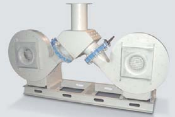
Back up fan system