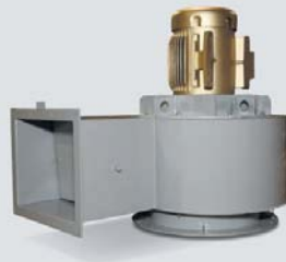
Flange mounted fan