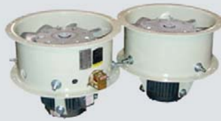
Special OEM fans