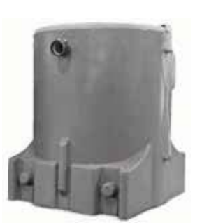
Polyethylene reservoir with insulation

The standard patented reservoir is a one-piece seamless design, rotationally molded from linear low density polyethylene and insulated with 3/8" dense foam insulation. The rectangular base accepts straight-line pump connections. The cylindrical shape adds structural strength. A tank baffle provides true 'hotcold' operation. The standard service cover has cut-outs for distribution piping and an inspection opening. The tank volume is adequate to support expansion to 2 times its original chiller capacity (adding MA or MW chilling modules and additional pumps).