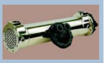
Hubbed Shell and Tube Heat Exchangers

Straight or U-tube, fixed or removable tubesheet general purpose exchangers designed to cool oil, water, compressed air and other industrial fluids. A variety of port configurations and materials are available. Diameters from 3" (7.62 cm) to 12" (30.48 cm).