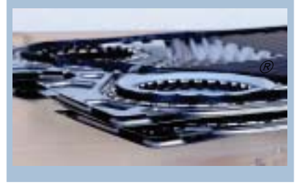
Semi-Welded Plate Heat Exchangers

Combines the high thermal efficiency, compact design, and low volumetric liquid hold-up of a plate heat exchanger with the leak prevention of a shell & tube. Ideal for ammonia applications.