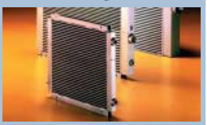
Air-Cooled Heat Exchangers

High efficiency, brazed aluminum coolers for cooling a wide variety of liquids and gases with ambient air. Lightweight, yet rugged. Capable of cooling multiple fluids in single unit. Models can be supplied with cooling fan and a variety of drives.