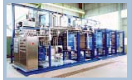
SigmaStar® Evaporator Systems

Utilizing the SigmaStar® plate, this evaporator system is designed to remove water or other solvents, while concentrating solutions. SigmaStar® Systems can be pre-assembled and pre-tested prior to shipment for quick and easy start up.