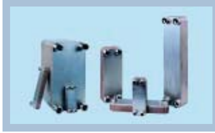
Brazed Plate Heat Exchangers

Off-the-shelf, standard units reflect the latest in plate heat exchanger technology for maximum performance and low cost. Ideal for OEM or aftermarket applications. Many models stocked and ready to ship. Models for process or refrigeration applications.