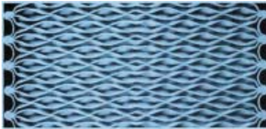
Cross section of plate pack

The fishbone geometry of the flow channels built by the plates effects high turbulence on the fluids that results in optimum heat transfer. The counter-current flow arrangement is the most thermally efficient for transferring heat.