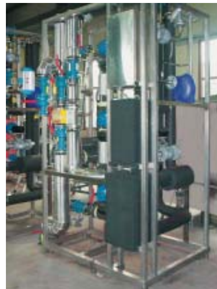
Compact reactor heating-cooling module