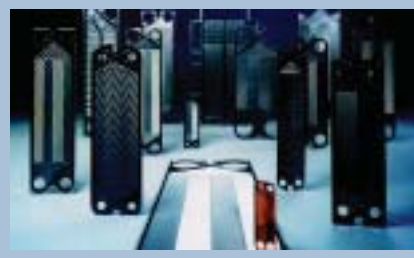
Gasketed Plate Heat Exchangers

The Schmidt-Bretten line of gasketed plate & frame heat exchangers provide excellent heat transfer in a compact space. Plates are pressed from stainless steel, titanium and other alloys. Gaskets of nitrile, EPDM, Viton®, compressed fiber and Teflon® are used. Capacities range from 0.5 to 10,000 GPM.