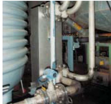
SIGMAWIG ST 40 tempering of chemical reactor

excellent for condensation of refrigerants, high pressure heating, or other applications requiring higher operating pressures