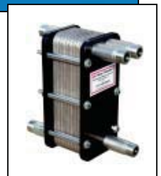
carbon steel frame