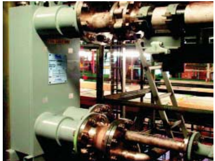
SIGMAWIG ST 30 for steam condensation

The Sigmawig all-welded plate heat exchanger consists of the required number of corrugated thermal plates arranged in alternating passages for counter-current flow, similar to gasketed plate heat exchangers. However, unlike the traditional plate & frame design which uses elastomer gaskets on the perimeter of each plate to create the seal, the plates of the Sigmawig units are sealed together hermetically by TIG welding the seams without filler. This greatly increases the maximum operating temperature and pressure.