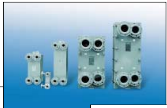
all stainless steel units