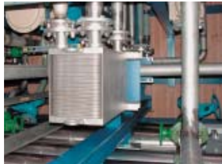
SIGMAWIG ST 12 tempering of chemical reactor thermoil/ ethylenglycol