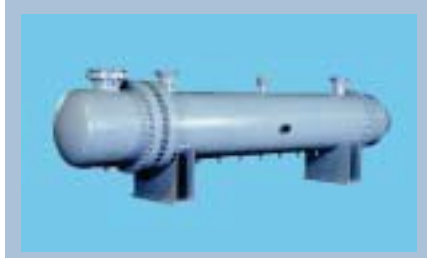
TEMA Shell and Tube

A wide variety of TEMA types are available using pre-engineered or custom designs in various sizes and materials. Shell diameters from 6" (15.24 cm) to 60" (152.4 cm), ASME, TEMA, API, ABS, TUV, PED and other code constructions available.