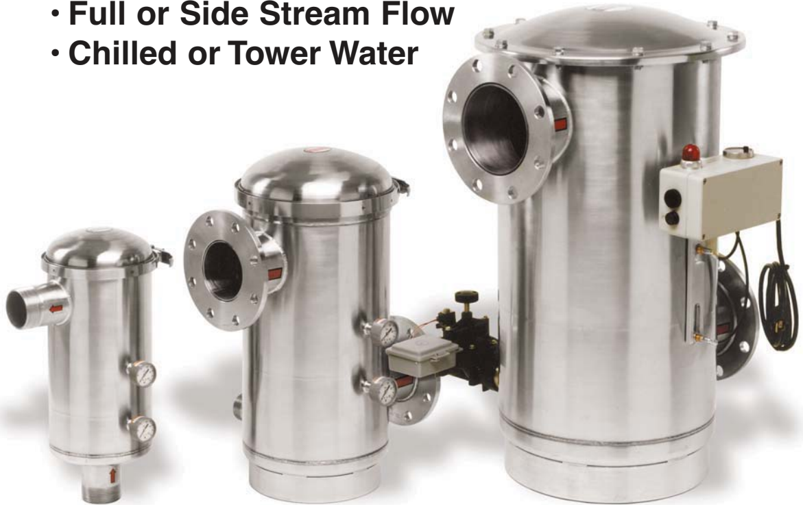
MLS-3 with optional pressure gauges