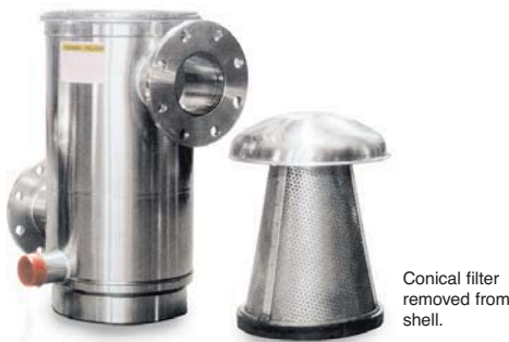
Conical filter removed from shell.

The MLS Series Filter can be customized to fit your specific needs.