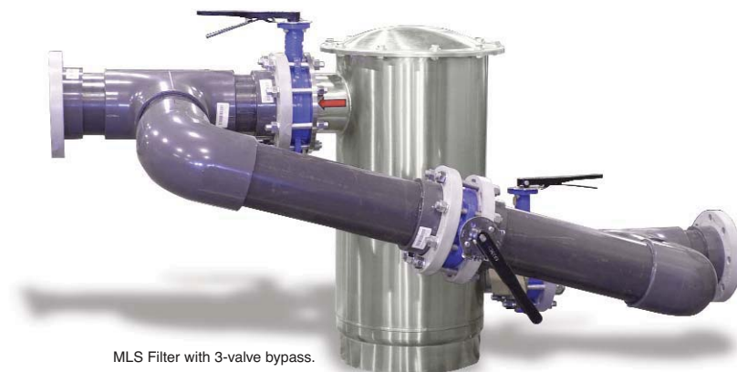
MLS Filter with 3-valve bypass.

WARRANTY & SERVICE... MLS Series Filters are supported by a comprehensive factory warranty. Refer to bulletin ADV-205 for complete warranty details. The Advantage service department is staffed with experienced technicians, and supported by a network of independent service contractors. With Advantage service is just a phone call away.