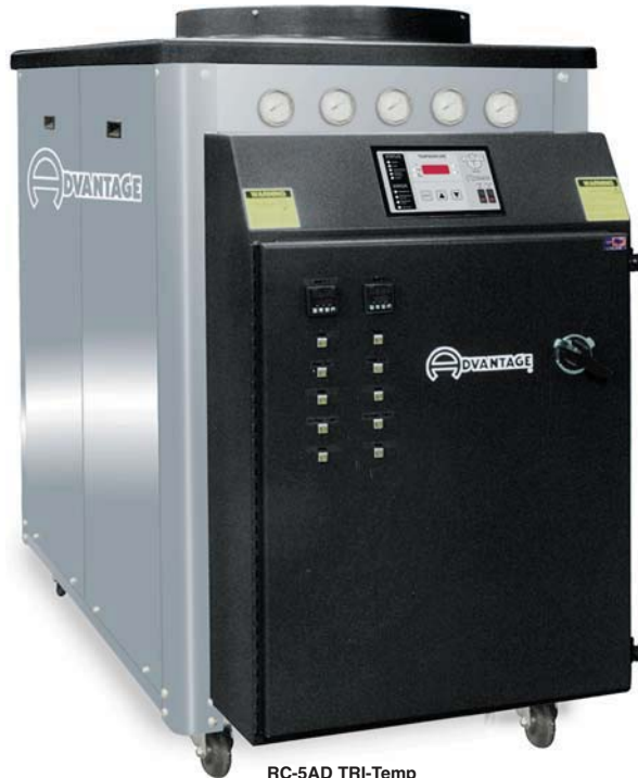
RC-5AD TRI-Temp shown with optional general purpose tempered water zone control and disconnect switch.

Bi-Temp and Tri-Temp units are designed for applications where independent zones of chilled water and temperature stabilized water are necessary.