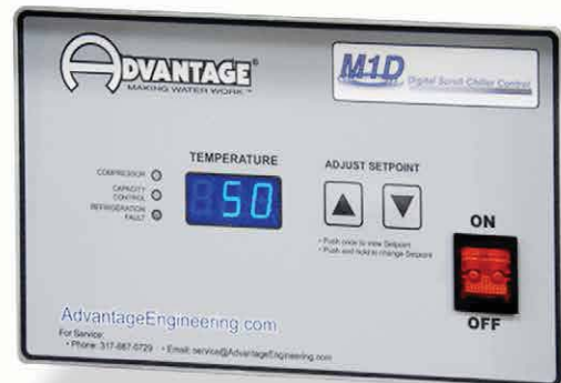
Advantage M1D Digital Scroll Chiller Control